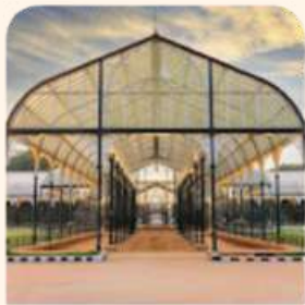
Lalbagh Botanical Garden