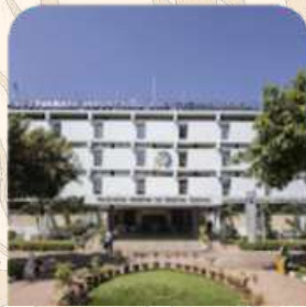
Visvesvaraya Industrial &...