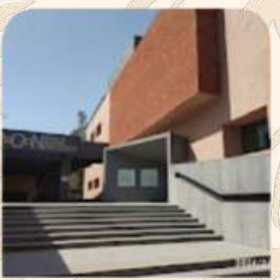
Science Gallery Bengaluru