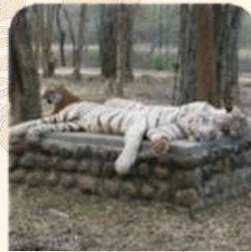
Bannerghatta National Park